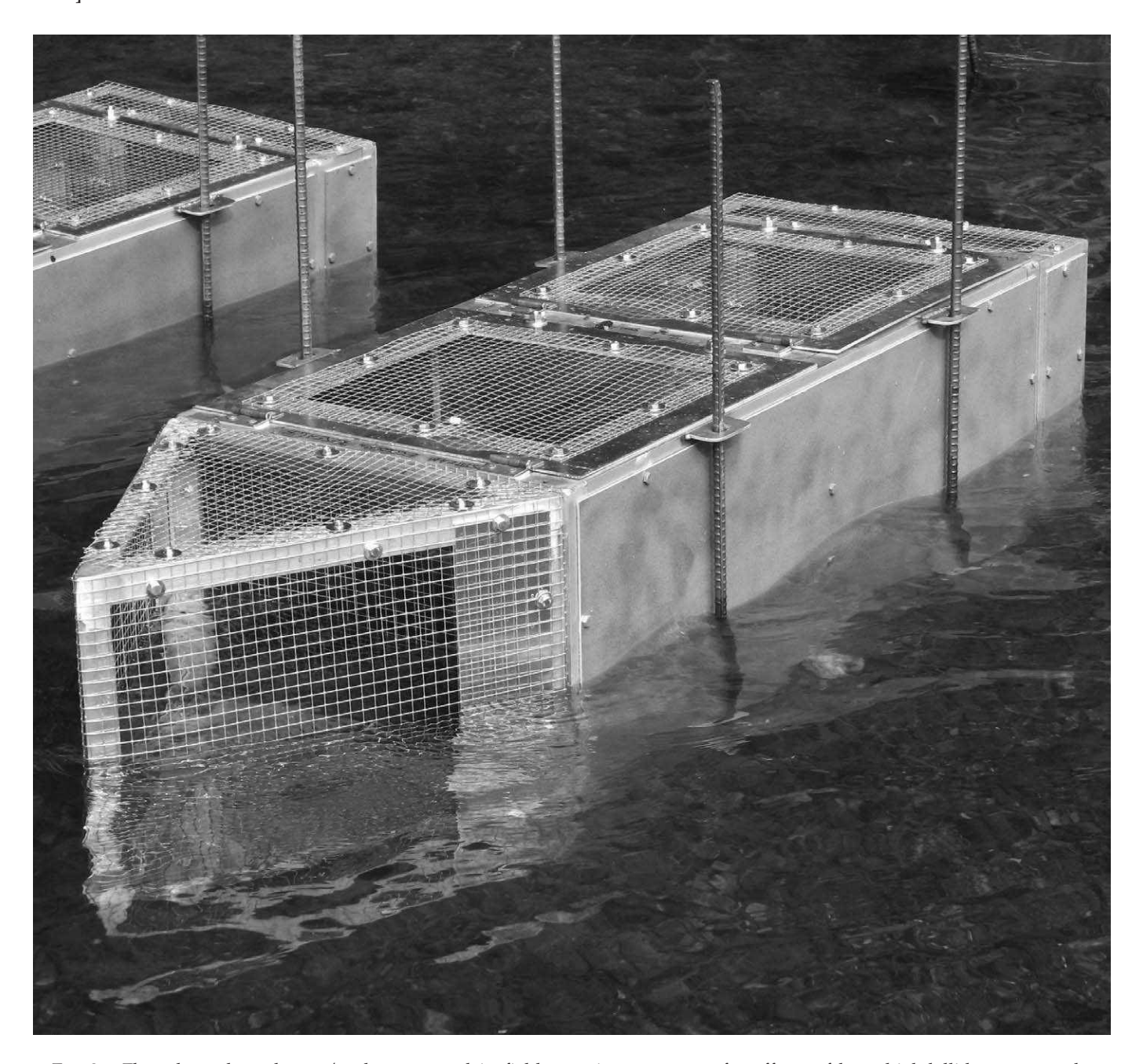
Fig. 3. Flow-through enclosure/exclosures used in field experiments to test for effects of branchiobdellid worms on host crayfish growth (Brown et al. 2012). Flow-through design maintains natural stream conditions while double-walled barriers prevent exchange of branchiobdellidans between enclosed and free-living crayfish.

needed to increase our knowledge of branchiobdellidan diversity and distribution and to inform studies assessing evolutionary and ecological patterns. In addition, work evaluating concordance among different data sets (e.g., morphological, molecular), and thus, species concepts, is needed to infer the evolutionary history of the Branchiobdellida. Basic life-history characteristics and the physiological constraints of most branchiobdellidan species remain undescribed.